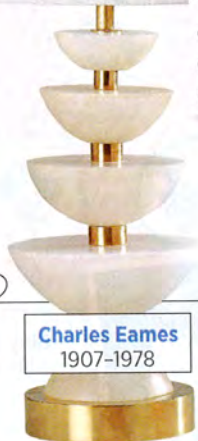
Charles Eames 1907-1978

Vaughan's alabaster "Positano" lamp features brass fittings and a space-age design, to the trade. (vaughandesign.com)