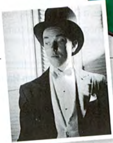
Tony Duquette The Dreamer

Elsie de Wolfe took credit for "discovering" Duquette, but this creative genius was already on his way to making an everlasting