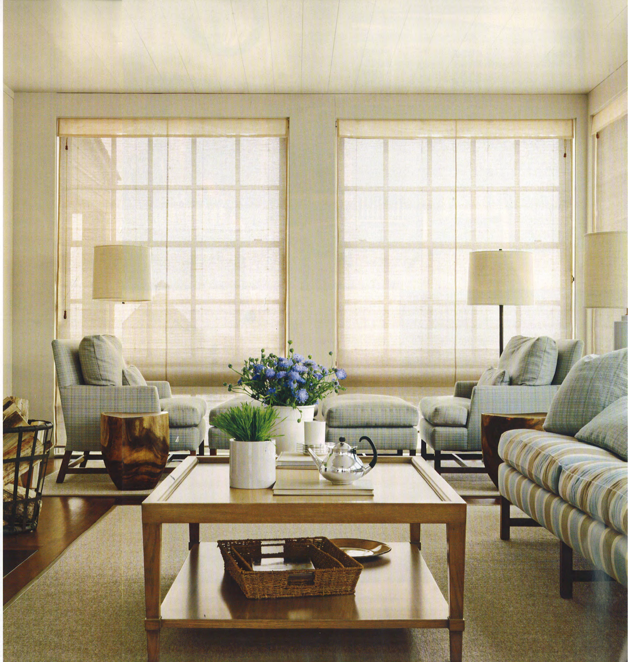
Overscale windows help brighten sunroom in winter. ABOVE AND RIGHT: Custom side table and dining table by Barbara Barry. Chairs by Richard Mulligan. Visual Comfort floor lamps by Barry; Paul Ferrante shades. Formations iron basket contains logs. Tucker Robbins cup-shaped stools. Custom coffee table by Barry. Chairs, ottomans and pillows in fabric by Barry for Kravet with sofa in Castel fabric; all pieces by Rose Tarlow-Melrose House. Decorative Carpets sisal rugs.